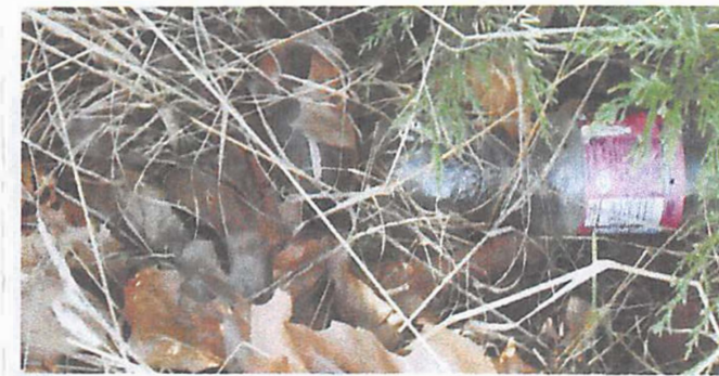
Fig 2 Part of the daily litter collection

Arlesey Road [Black Box] ESSO garage. New football club.