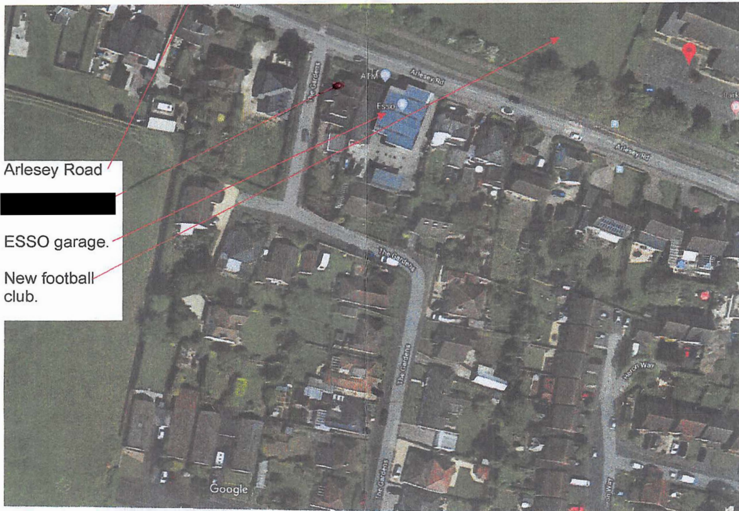
Fig. 1 Layout

Arlesey Road [Black Box] ESSO garage. New football club.